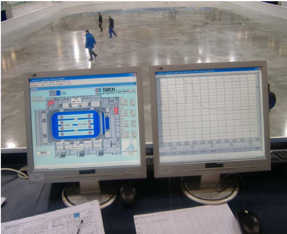
The Ice Rink Control Room, from where the operators manage the sport complex by using the Movicon supervision system.

The project, plant realization and maintenance was commissioned to Baron Thermodynamics Spa, a company based in Creazzo (Venezia, Italy) which has been planning and producing industrial refrigerator and air conditioning and cooling systems since 1946. Specialized in thermodynamic systems for the food industry, the company is also quite active in sport center installations, having already realized 25 ice rinks in Italy. The Pinerolo sport complex covers a surface area of 6,000 square meters (about 2,000 iced surfaces) and has four curling rinks which accommodate up to 2,300 places with the capacity to be very flexible on rearranging space after such events as the Turin 2006 Olympic games, for local sports, recreation and sport events. The rink can also be used not only for hockey, curling, short track and artistic ice-skating but also for theatrical shows. "It was a great challenge to build and maintain this complex" admitted engineer Giuseppe Baron from Baron