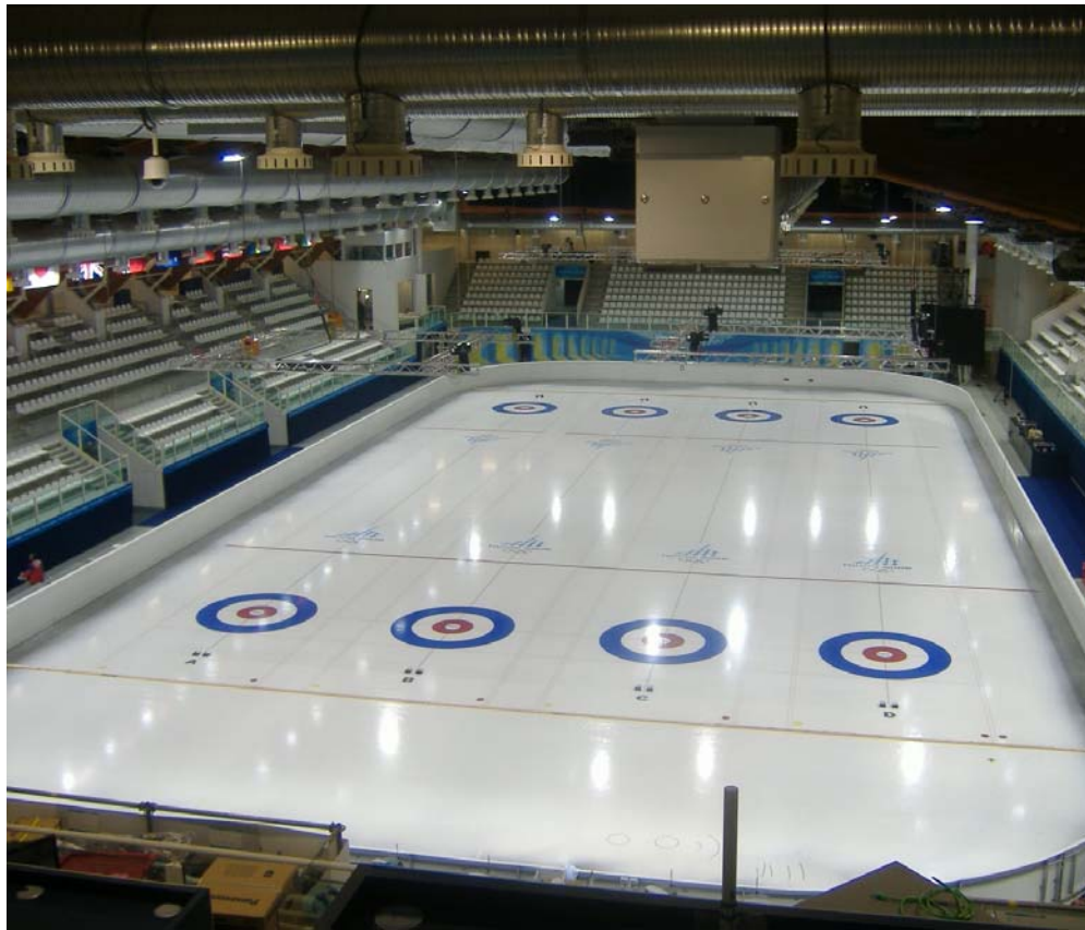
Lo stadio olimpico del ghiaccio di Pinerolo, realizzato da Baron Termodinamica Spa con le piste del Curling.

Among the most interesting projects realized for the Turin Winter 2006 Olympic games was the new Polyfunctional Ice-rink of Pinerolo (Turin, Italy). The ice-rink, built with the most modern and innovative technology, hosted the Men and Women's curling tournament (Round Robin, semifinals and finals). This sport, not that well known in Italy, was in the limelight at the Turin Winter 2006 Olympics by being a big public success. Curling originated in Scotland where it was played on frozen-over lakes. A demonstration of this game was given in the Chamonix 1924 Winter Olympics for the first time but it was not part of the Olympic program. Other demonstrations of this game were given in the 1988 and 1992 Winter Olympics and it was not until 1992 that it officially became an Olympic sport. In Curling, which was an huge unexpected success with the success, two teams battle it out on the ice in a match very similar to the very popular Italian bowling game called 'bocce'. The athletes have to get the 'stone' which is a smooth round shaped