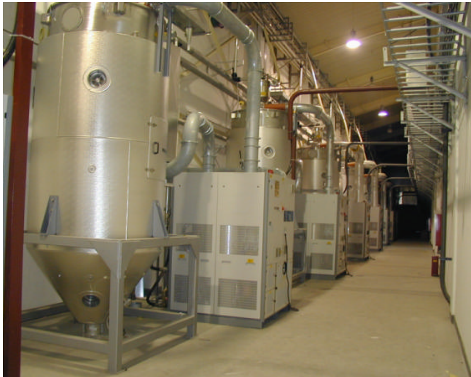
A part of the Shanghai Zi Jiang Group's PET bottle production plant in China.

CSA Laboratories, a part of the Piovan business group, develop control systems in the plastic industry sector, and has recently realized a bottle production plant in PET based on Movicon for the Shanghai Zi Jiang, Chinese business group