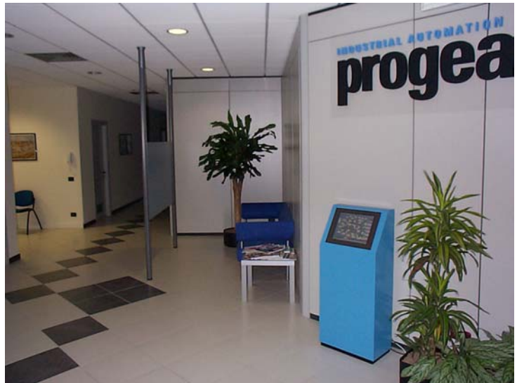
A view of Progea's new offices where the EIB system has been applied, i.e. the bus-bar system for building automation.

The I/O on the bus-bar are basically detected by two different mechanisms: some of the data are linked straight to the PC in the broadcasting mode so that when a node in the field records a status variation the information is directly transmitted to the supervisor PC without this latter having to make a request for it. For example, the alarms concerning the protection switches are connected straight to the PC. When a switch goes OFF (or ON), the variation is transmitted to the PC. This technique does away with traffic in the network due to continuous requests from the PC for these values, with the added advantage of instantaneous signalling. Since signals are only transmitted to the PC the moment in which a variation occurs, the signal loss that would occur if the PC were off or disconnected at that moment can also be avoided by using the polling mode. This technique allows the signal to be transmitted in a spontaneous way at regular intervals, every minute or half-minute for example. The communication driver allows one mode or the other, or both to be selected.