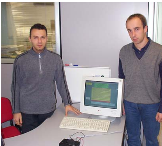
The Logis Srl control centre and technicians

The control center gathers and classifies data relating to the water quality results obtained by the control units.